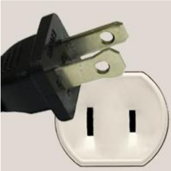
Type A MPA-GS750-00 2 pins, not grounded, 15 A, almost always 100 – 127 V mainly used in the USA, Canada, Mexico & Japan