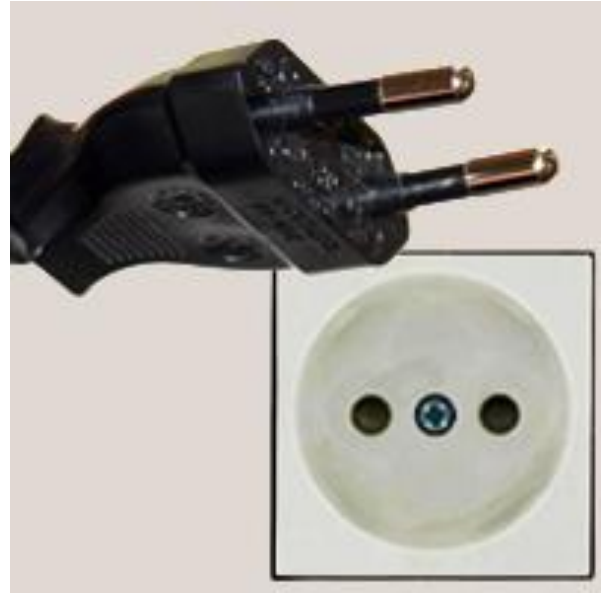
Type C MPA-GS750-00-C1 2 pins, not grounded, 2.5 A, almost always 220 – 240 V commonly used in Europe, South America & Asia