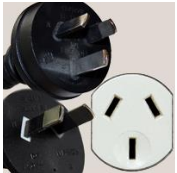
Type I MPA-GS750-00-I1 2 or 3 pins, grounded if 3 pins, 10 A, 220 – 240 V mainly used in Australia, New Zealand, China & Argentina