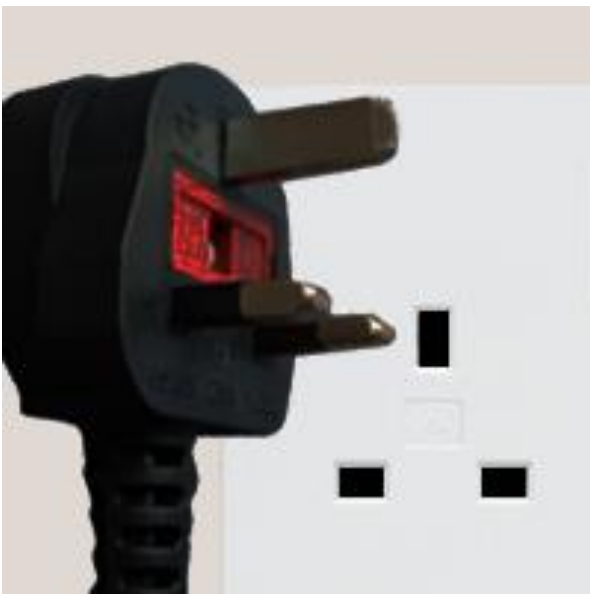
Type G MPA-GS750-00-G1 3 pins, grounded, 13 A, 220 – 240 V mainly used in the United Kingdom, Ireland, Malta, Malaysia & Singapore