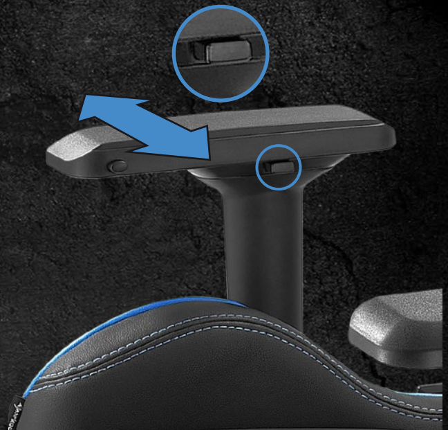
Individually adjustable in width