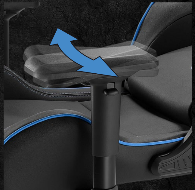
Easily adjust the angles