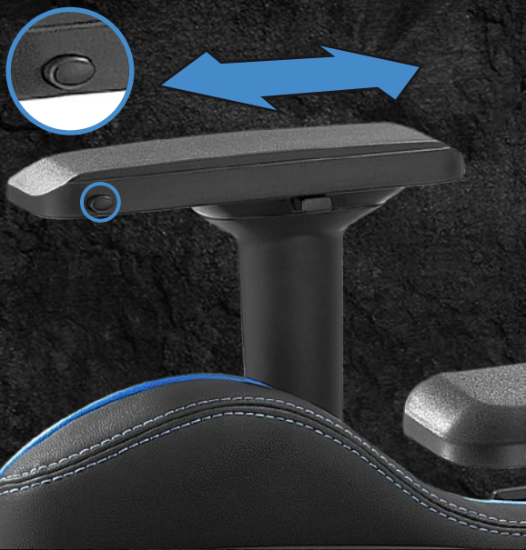
Customizable to every arm length