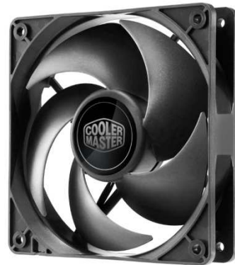
CM exclusive Silencio FP fan technology