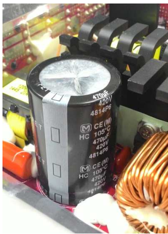
100% Japanese Capacitors