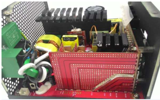
Unique 3D circuit to save power losses and boost efficiency