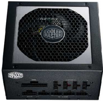
Fully modular design for easy cable management