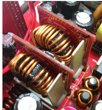
DC-DC circuit design to enhance voltage stability and transient response